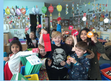
Our pen-pals at Feniscowles Primary School in England received our origami!