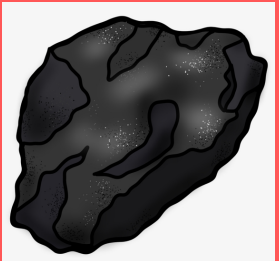
We use coal to keep fires burning!